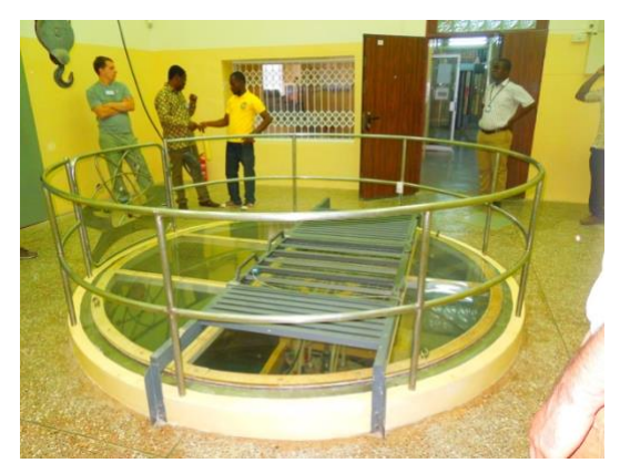
Fig. 1. The GHARR-1 Research Reactor

Energy Authority (CAEA), DOE-NNSA, and the IAEA formed a team to conduct the preparations and planning for the project.