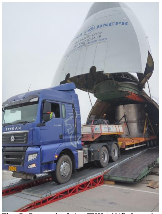
Fig. 7. Removal of the TUK-145/C from the Antonov