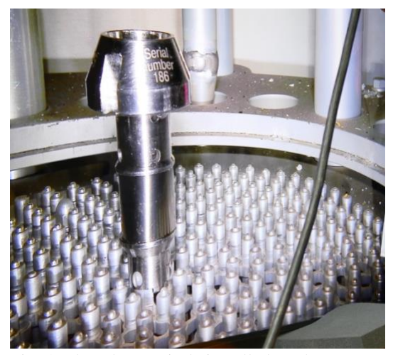
Fig. 4. The adapter pintle installed on the core

The MNSR core uses a simple bayonet bail to facilitate installation. This bail represents a very small target for a remotely operated grapple. To address this situation, SOSNY developed a mushroom shaped adapter pintle (Fig. 4) that can be manually affixed onto the bayonet and locked in place. This provides a much more robust target for the grapple device to grasp as it is lowered onto the core.